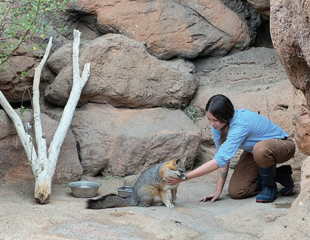
(left) A kit fox enjoying some attention in the Life Underground display. (right) Along the Desert Loop Trail.