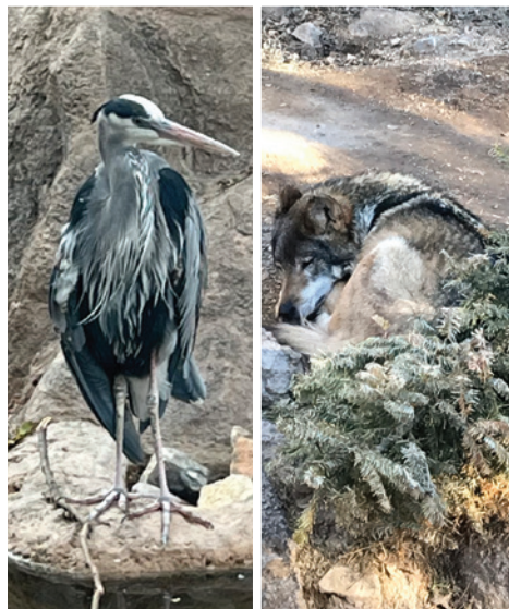
(top) A mountain lion. (bottom) A great blue heron (left) and a Mexican wolf (right).