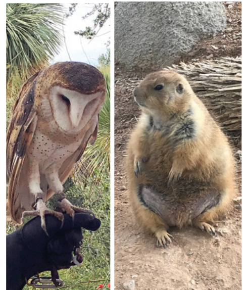
(top row) Desert owl (left). A prairie dog in the Desert Grasslands exhibit (right). (center) A coyote on the Desert Loop Trail. (bottom) An ocelot in Cat Canyon (left). (right) The museum entrance.